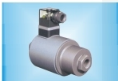
A45, KB, ECD - H, KBS, MCF - H, VMK - H, VFK - H, PCD