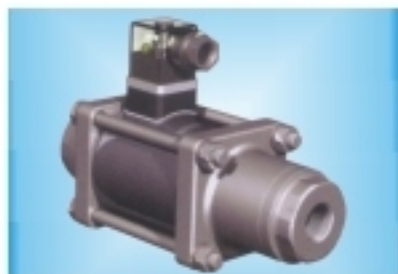
MK, FK, CFM, MCF, VMK, VFK, VSV, FCF