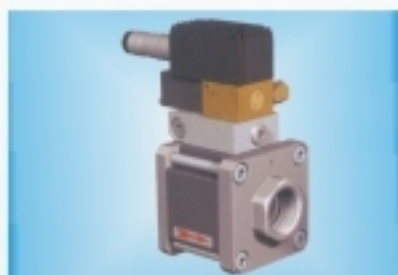
HPB, SPB, HPP, SPP, PC, RMQ